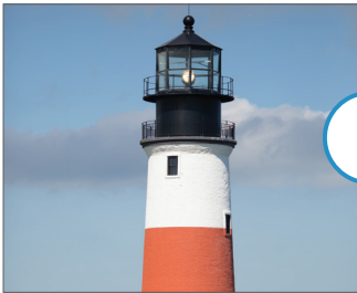
5. Sankaty Head Lighthouse