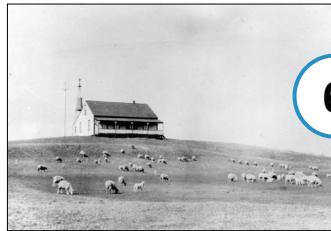
6. Old Siasconset Golf Course