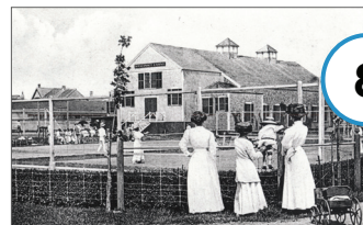
8. Sconset Rotary & Casino