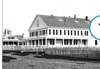
7. Main Street