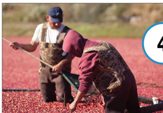
4. Milestone Cranberry Bog