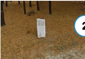
2. Milestone Marker #4